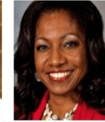
Florence Champagne Community Outreach